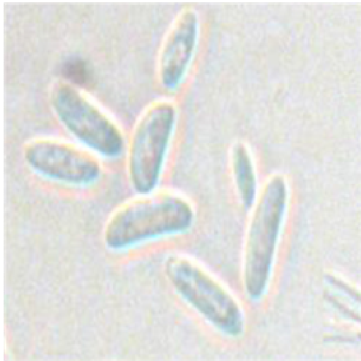
Figure 2. Conidia of Fusarium solani .