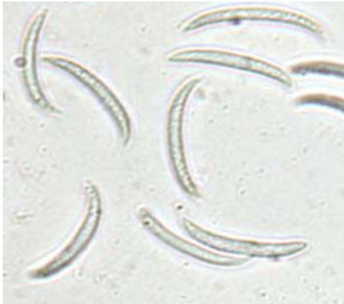
Figure 1. Conidia of Colletotrichum dematium .