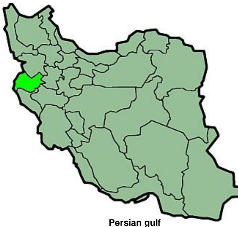
Figure 1. Map of study site in Iran.

maximum amylases content. He also concluded that amylases content increases by water sufficiency during generative stage and filling grain stage. Studies showed that water deficit reduce tillering number during vegetative stage and seed weight and quality, during filling grain stage (Juliano and Pascal, 1980). Water deficit stress induce reduced amylases and filling grain stages (Juliano and Pascal, 1980; Singh et al., 2000). Sufficient water induced increase of tiller number, panicle and spikelet number during flowering stage and increase filling grain stage (Ouk et al., 2003). There is a relation between amylase content and drought resistant. Therefore, this investigation was carried out to detect amylases content variability of rice as affected by drought stress.