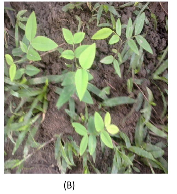
Figure 1. (a) Three young seedlings (I - III) of C. fistula just sprouting from the broken pods, (b) A group of four seedlings at the two or three paired leaves stage.