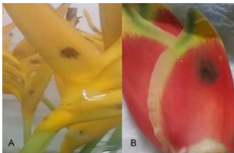
Figure 2. Inflorescences of Heliconia psitacorum cv. Golden Torche (A) and Heliconia rostrata (B) with anthracnose symptoms.