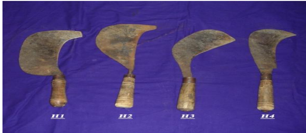
Figure 3. Screened sugarcane harvesting knives.