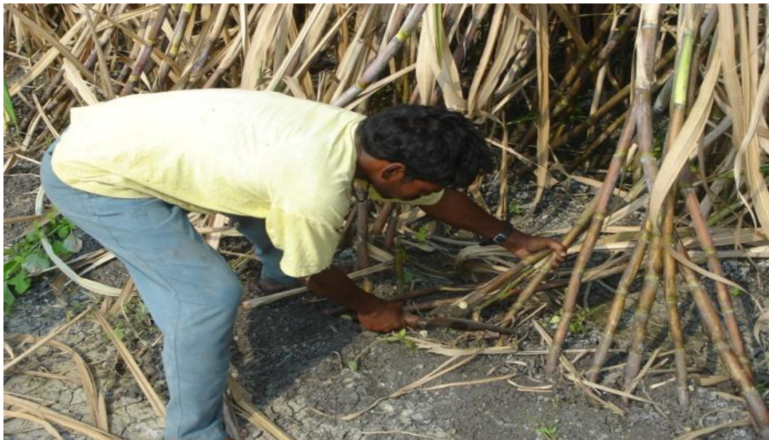
Figure 2. View of sugarcane harvesting knife in operation.