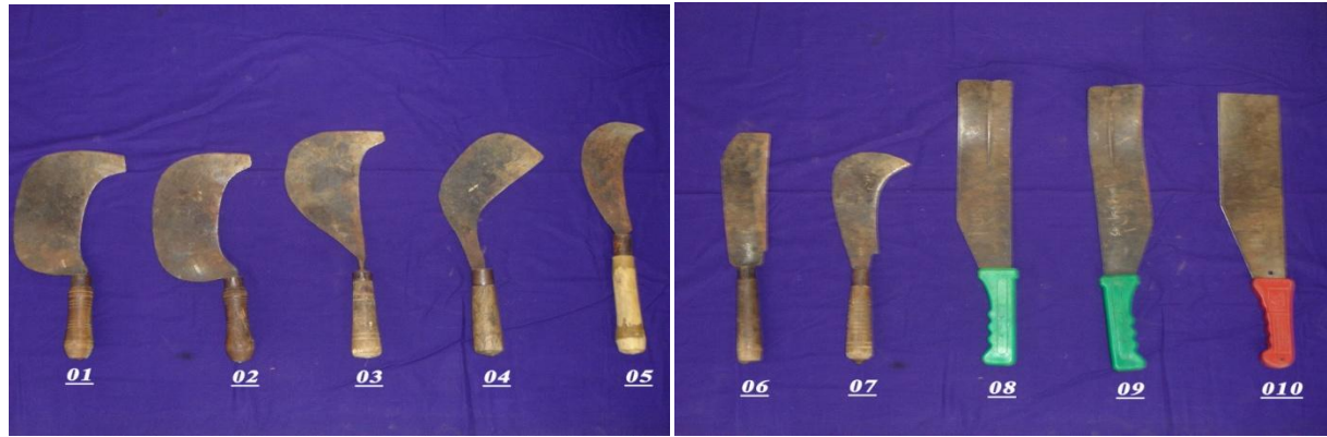
Figure 1. Different sugarcane harvesting knives selected for ergonomical evaluation.