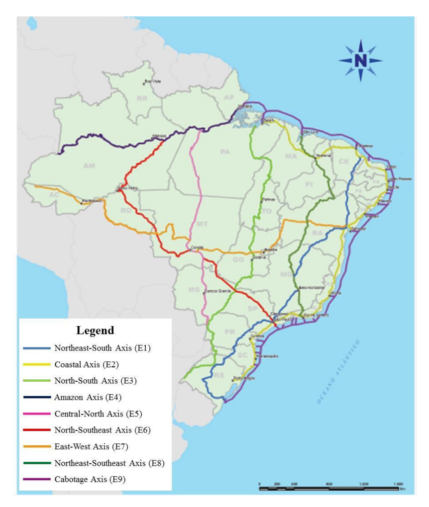
Figure 2. Structural Axis proposed by Projeto de Integração Nacional from the federal government, Brazil.

country are more debated, with the aim to boost its insertion into globalization. Therefore, the establishment of a set of national objectives that would make the country more competitive in the global scenario is of extreme importance for the success in international trade (Caixeta Filho, 2010).