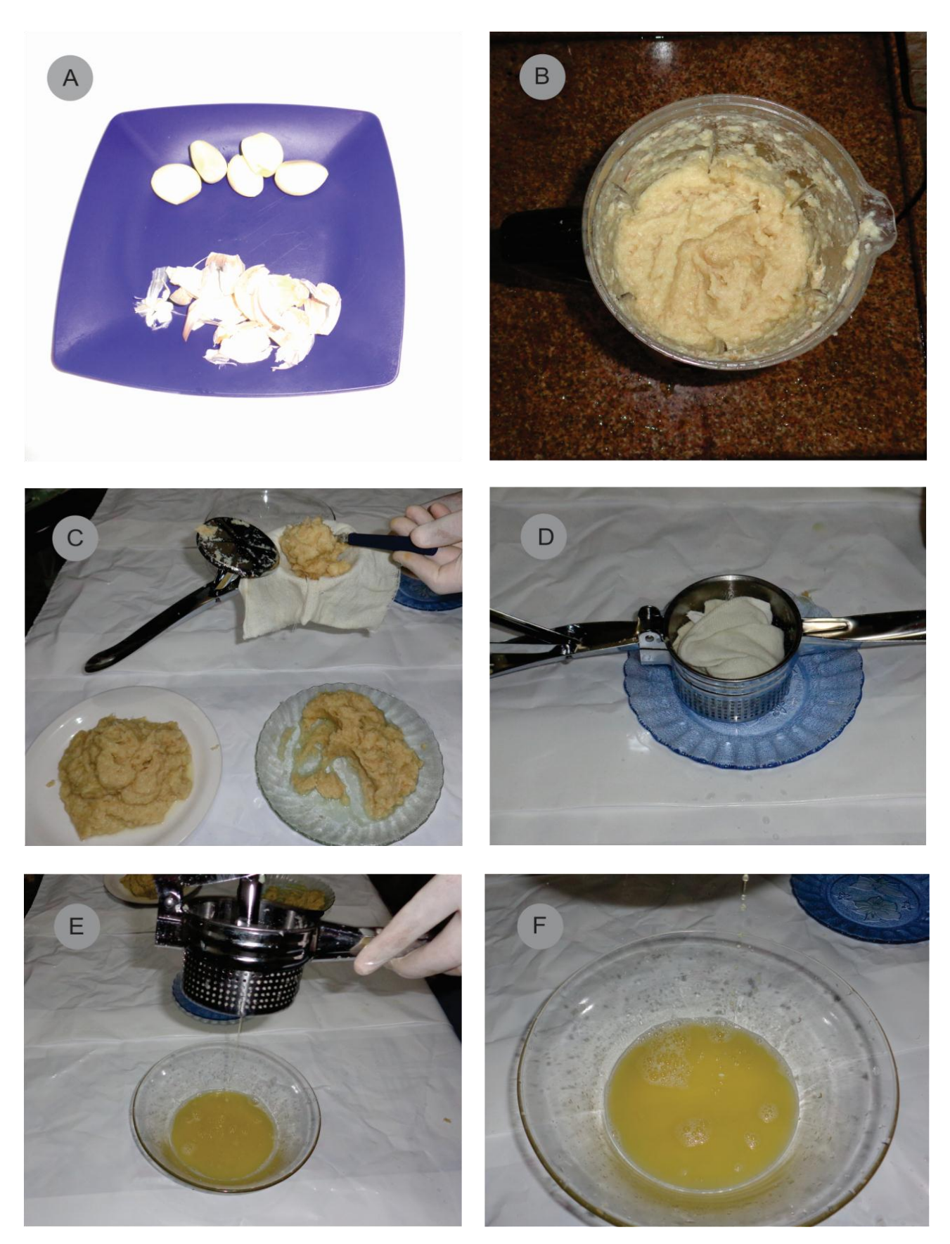
Figure 1. Obtaining the Natural Garlic Extract (NGE) with removal of the bark of garlic loves (A); grinding of garlic cloves; (B); pressing and filtering of the dough (C and D) and extraction of NGE (E and F).