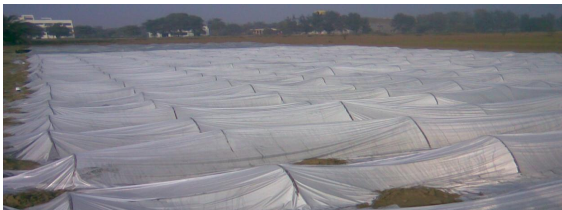
Figure 1. View of experimental field with low tunnels during winter.

F= Fresh canal water; S = tube well saline water.