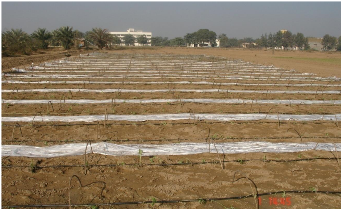
Figure 2. View of the experimental field after removing plastic cover during day time.