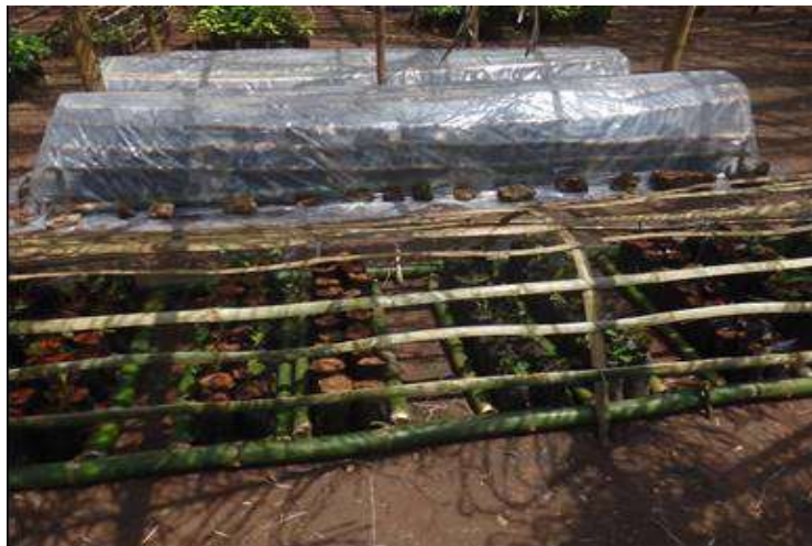
Figure 1. Tunnel cuttings.