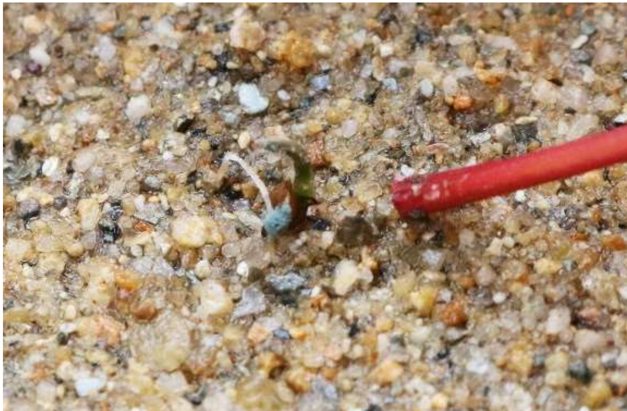
Figure 3. Phytotoxicity of pretilachlor on barnyard grass emergence after 5 days application of herbicide.

showed that weed fresh and dry weight were significantly different among the treatments. The fresh and dry weight of barnyard grass ranged from 0.0 \text{ g m}^{-2} (T4 and T5) and 0.0 \text{ g m}^{-2} (T4 and T5) to 336.7 \text{ g m}^{-2} (T1) and 31.8 \text{ g m}^{-2} (T1) at tillering stage, respectively. Tukey test analysis showed a significant difference in fresh and dry weight of barnyard grass between the treatments applied pretilachlor (T2, T3, T4, and T5) and control (T1) but there was no significant difference in fresh and dry weight of barnyard grass among treatments applied herbicide. The fresh and dry weight of barnyard grass in pretilachlor treatments at the recommended rate ranged from 13.3 to 60.0 \text{ g m}^{-2} and 0.6 to 1.6 \text{ g m}^{-2} , respectively. The rice yield ranged from 6.59 (T1) to 8.25 \text{ t ha}^{-1} (T5). There were significant differences in rice yield between the treatments applied pretilachlor compared with the control by Tukey test analysis but there was no significant difference in rice yield among the treatments applied herbicide. The weed index ranged from 2.1 (T3) to 26.9\% (T1). Although the competition of barnyard grass in the treatment applied pretilachlor at the recommended rate has not caused a significant decrease in rice yield, this indicates that there is resistance in populations of barnyard grass in Thua Thien Hue to pretilachlor in the field.