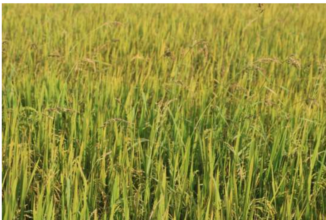
Figure 2. Barnyard grass that had regrown in fields subjected to herbicide application.