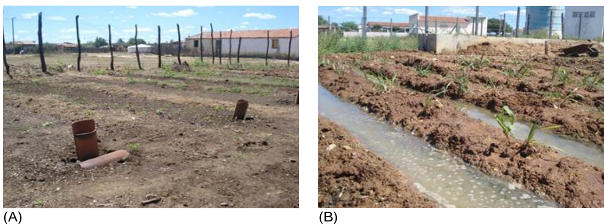
Figure 2. Smart beds to grow vegetables irrigated by subsurface (A) and elephant grass grown with furrow irrigation with waste from water desalination (B).