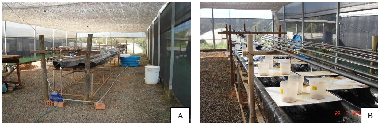
Figure 1. Test bench (A), reservoir and mechanical stirrer (B), flow measurement collectors (C) and vinasse application residues held in the test bench trough.