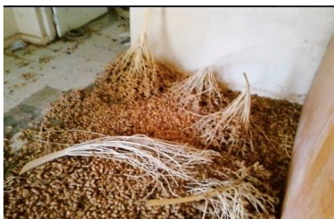
Plate 16. Flowers.

an elevated place for composting. In between coconut trees, shade under any tree is good for composting. The shady area conserves the moisture in the composting material. The floor of the compost making area should be leveled. If earthen floor is available the floor can be made hard by hard pressing and also by applying cow dung slurry. Presence of roof over the composting material is advantageous, since it protects the material from rain and severe sunshine (Plate 13).