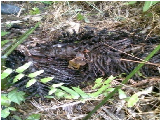
Plate 7. Empty raphia palm fruit bunches.