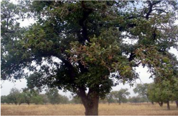
Plate 9. A typical Shea tree.