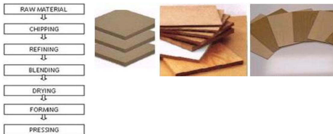
Figure 1. Flow chart of the MDF manufacturing and samples of MDF.