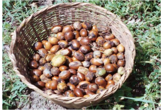
Plate12. Shea nuts.