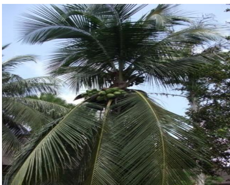
Plate 5. A coconut palm, Nigerian Institute for Oil Palm Research (NIFOR), Nigeria.

The research and development for the preparation of advanced carbon products from oil palm empty fruit bunch (EFB) had been embarked since 2003, and with recent technology, MPOB successfully developed a process on preparation of carbon pre-cursors for the production of carbon electrode, electrical carbon brushes and Molecular Sieve Carbon (MSC) for gas filtration from EFB. Chemical treatment, carbonization and physical activation processes were applied to the carbon pre-cursors for the preparation of high porosity activated carbon powder and carbon pellets.