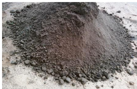
Plate 17. Cow dung.