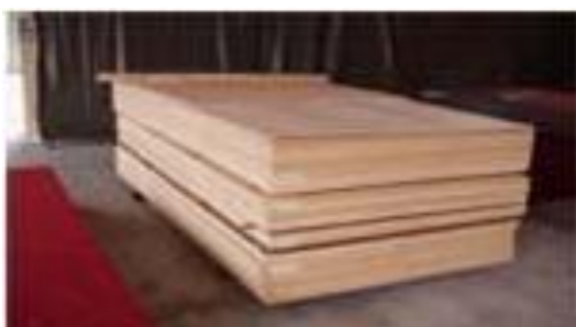
Plate 3. Plywood from oil palm trunk.

mill effluent (POME), mesocarp fiber and palm kernel shell/ cake residue (Yusoff, 2006).