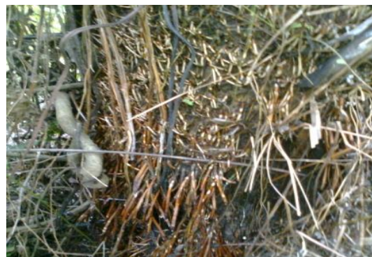
Plate 8. Raphia roots.

beneficial to human. More and more research efforts are being put forward to prove that it has many medicinal values such as an important dietary supplement to boost up immune system, assists constipation or digestive problems, assists weight control, anti-cancer agents, anti-aging properties and many more; (20) dye- the roots of the coconut plant are used as a dye.