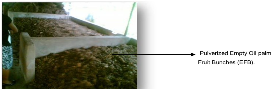
Plate 13. Typical cells used in composting, NIFOR main station, Benin City, Edo State.