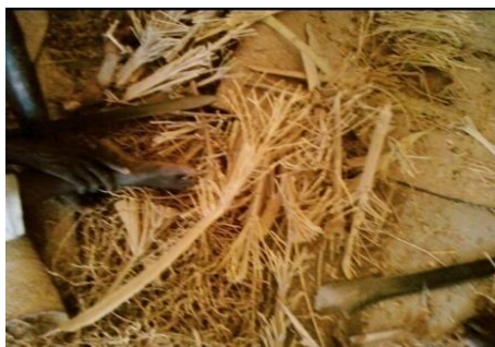
Plate 15. Sticks of bunches.