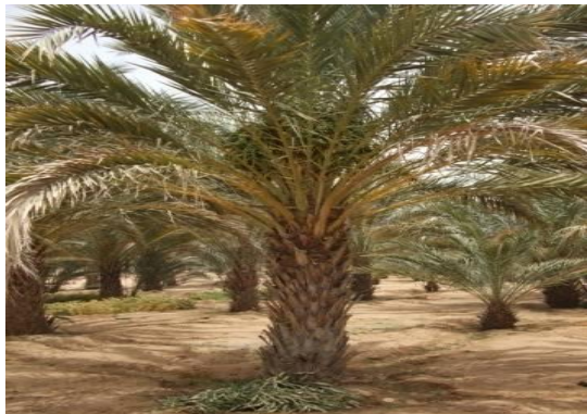
Plate 6. Date palm Tree in the field, NIFOR Sub-Station, Dutse.