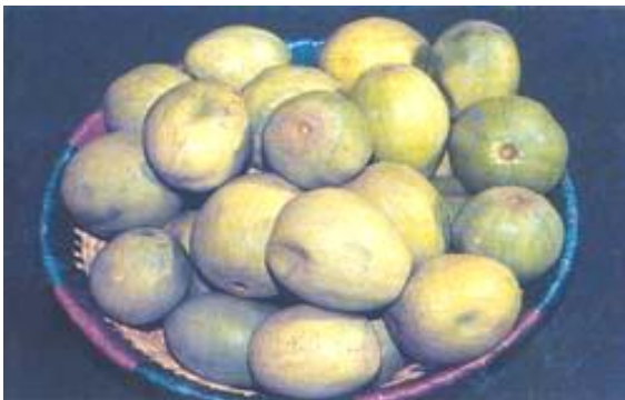
Plate 11. Shea fruits.

husks have a capacity to remove considerable amounts of heavy metal ions from aqueous solutions for example with waste water. These were found to be more effective than the melon seed husks for absorption of lead, Pb (11) ions (Eromosele and Otitolaye, 1994). There is need to conduct further research on the potentials of Shea husk.