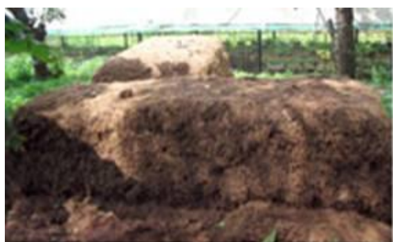
Plate 14. Coir pith heap.