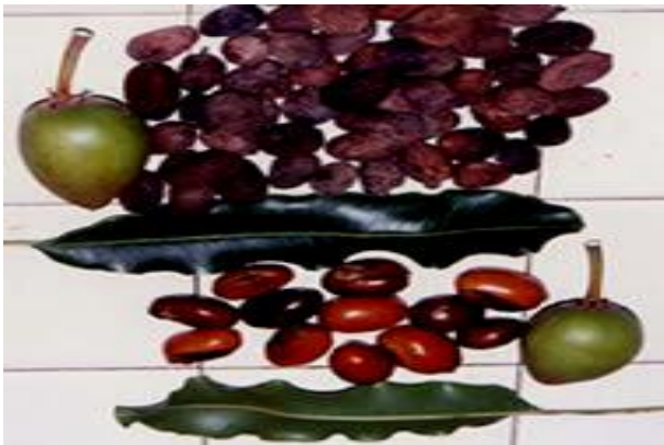
Plate 10. Shea fruits, seeds, nuts and leaves.