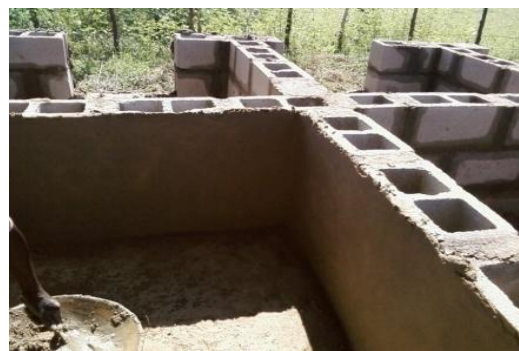
Plate 18. Compost cells under construction.