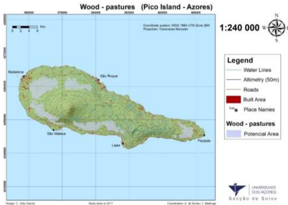
Figure 2. Potential wood-pasture areas on Pico Island.

with the intensification of the production system.