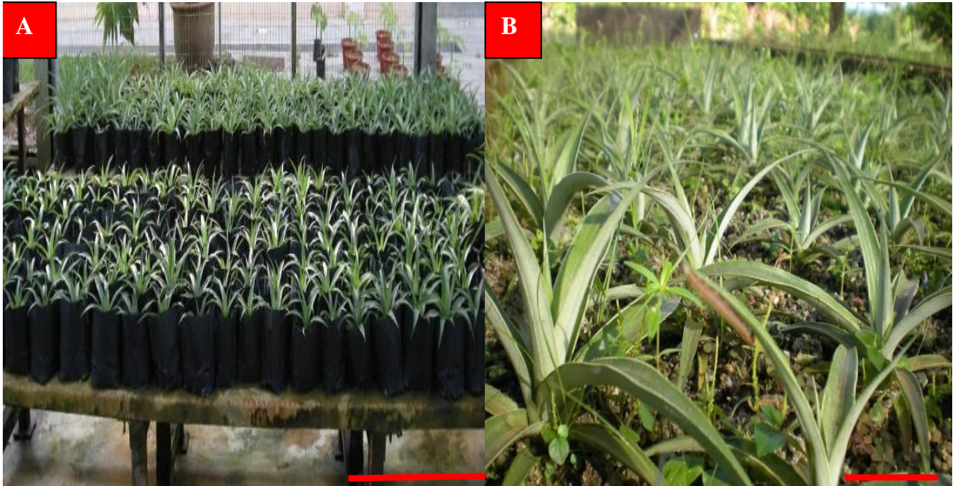
Figure 4. Production of ex-vitro pineapple plants. (A) Plants acclimatization in the greenhouse; (B) Three-month-old plants in the field. Bars represent 1 cm : 5 cm.

Sherrington, 1984; Alvard et al., 1993). It has also been shown that liquid medium disperses phenolic exudates from the explants, consequently, resulting in faster growth rate (Kyte and Kleyn, 1996).