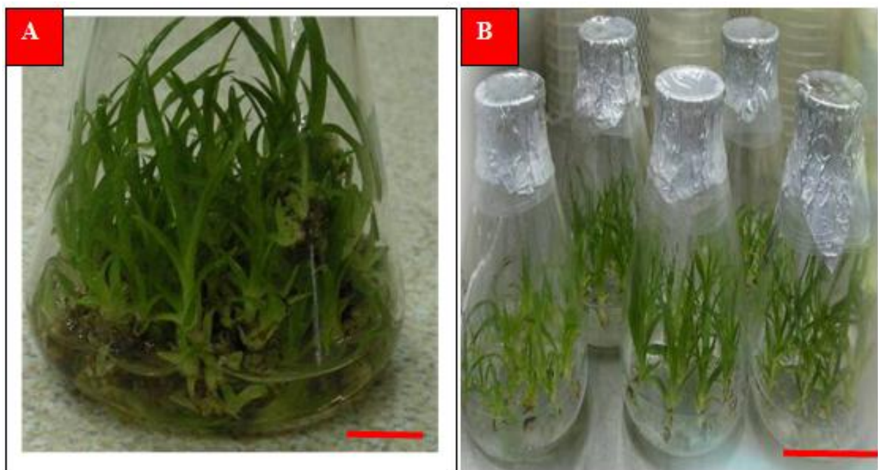
Figure 3. Shoot proliferation of Maspine pineapple in liquid (A) and on solid MS medium (B) after 12 weeks supplementation with 5 mg/l BAP. Bars represent 1 cm : 2 cm.