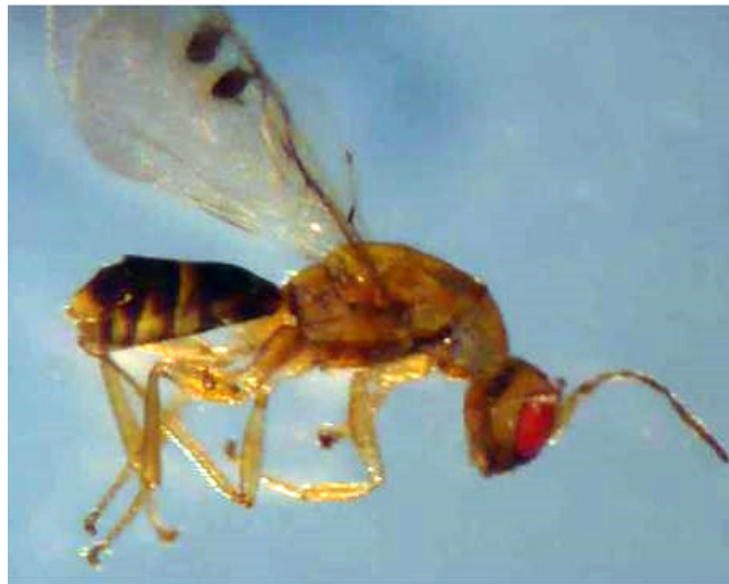
Figure 3. Male lateral view.

and closed below, the stigma is conspicuous and its uncus is distinct, and the stigma is 1.5 times as long as it is broad (minus uncus). Moreover, the hind coxae are dorsally striated and hairy, and their relative lengths are 40, 45, 75 and 60 for hind coxae, femur, tibia and tarsus, respectively.