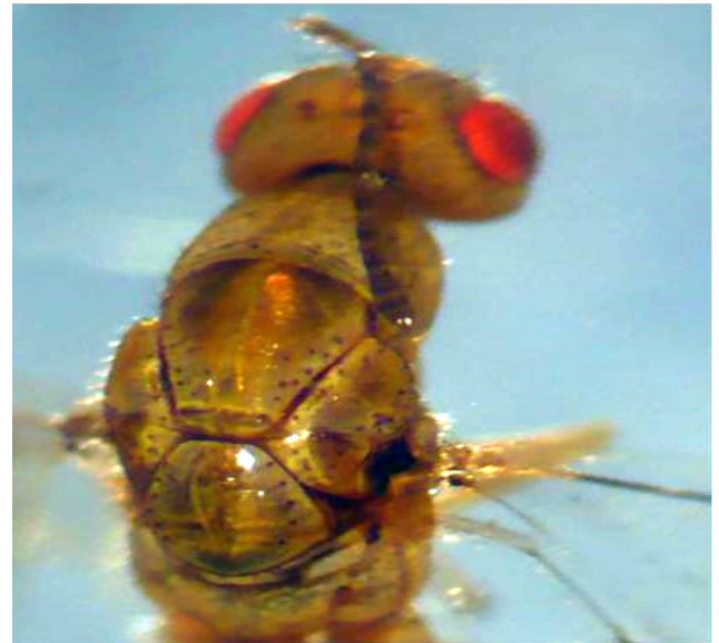
Figure 5. Female head and thorax dorsal view

Paratypes comprised 10 females and 5 males (on card) and 18 females and 10 males (in alcohol) with the same data as the