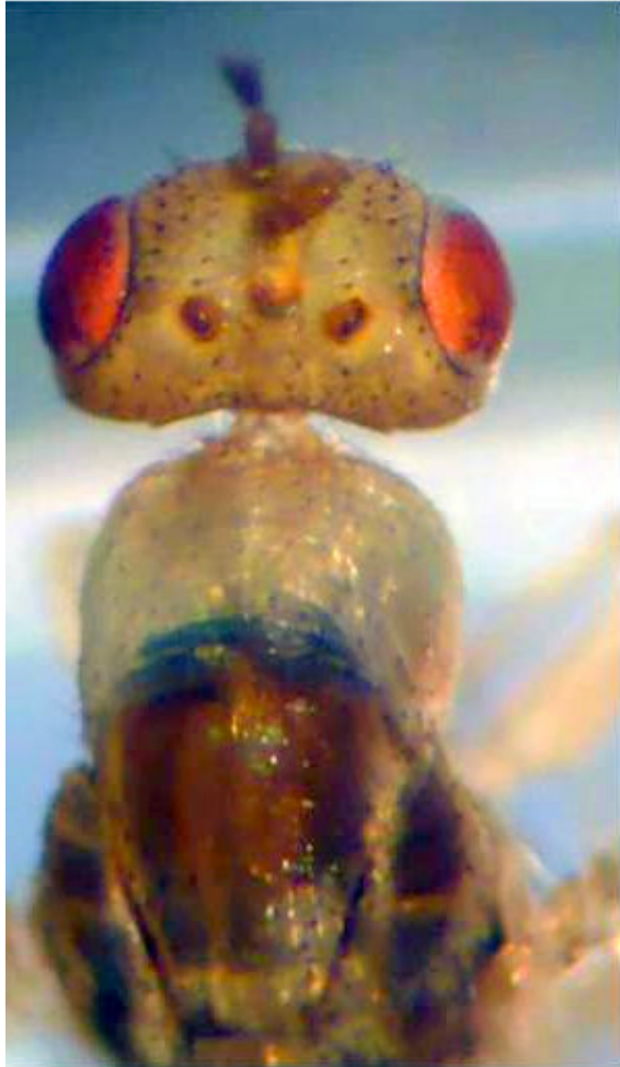
Figure 4. Female dorsal view.

are of equal length with a double row of long sensillae. The clava is 2.1 times as long as the preceding segment, and the forewing (Figure 6) is 2.10 times as long as it is broad. Nonetheless, the stigma which is relatively much darker and distinct its uncus, is 1.35 times as long as it is broad (minus uncus).