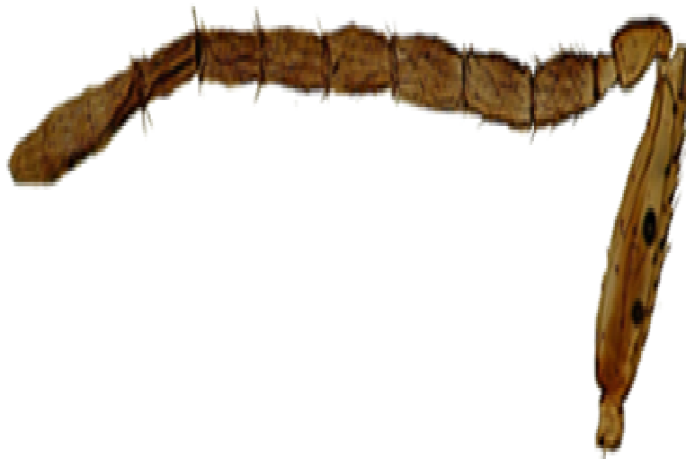
Figure 9. Female antenna.

body and 1.33 times as long as the gaster (ovipositor sheath is 0.7 times as long as the body and 2.1 times as long as the gaster in M. atlanticus ). The first funicular segment is as long as the pedicel (that is, 1.3 times as long as the pedicel in M. atlanticus ).