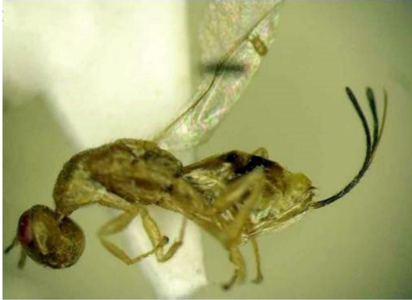
Figure 2. Female lateral view (on card).