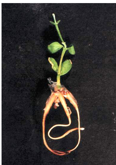
Figure 3. Complete plantlet developed from an explant of PKJ-3 on MS medium containing 5.55 \mu\text{M} BA + 6.1 \mu\text{M} IBA.

*Means sharing similar letter(s) in a group are non-significant at \alpha = 5\% (DMR test).