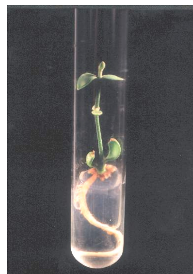
Figure 4. Complete plantlet developed from an explant of PKJ-3 on MS medium containing 5.55 \mu\text{M} BA + 6.7 \mu\text{M} NAA.

\mu\text{M} BA + 12.2 \mu\text{M} IBA produced the minimum number of nodes per primary shoot. The explants of PKJ-3 led the other genotypes, while those of PKJ-2 trailed with the minimum number of nodes. The highest number of nodes was attained when the explants of PKJ-3 were cultured on the medium containing 5.55 \mu\text{M} BA + 7.1 \mu\text{M} IAA. However, this PGRs combination stood at par with that of 5.55 \mu\text{M} BA + 6.7 \mu\text{M} NAA for the same genotype. The lowest number of nodes was attained when the explants of PKJ-2 were cultured on the medium supplemented with 11.1 \mu\text{M} BA + 12.2 \mu\text{M} IBA that was at par with PKJ-5 for the same combination and also under the combination of 11.1 \mu\text{M} BA + 6.1 \mu\text{M} IBA. Number of nodes is directly correlated with shoot length. As bud sprouting was delayed in the explants of PKJ-2 and there was the minimum length of primary shoot in response to the combination of 11.1 \mu\text{M} BA + 12.2 \mu\text{M} IBA, it produced