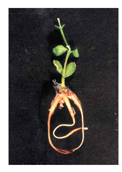
Figure 3. Complete plantlet developed from an explant of PKJ-3 on MS medium containing 5.55 \,\mu M BA + 6.1 \,\mu M IBA.

*Means sharing similar letter(s) in a group are non-significant at \alpha = 5% (DMR test).