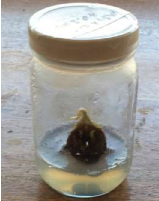
Figure 3. In vitro germination of pecan seed ('Ukulinga').