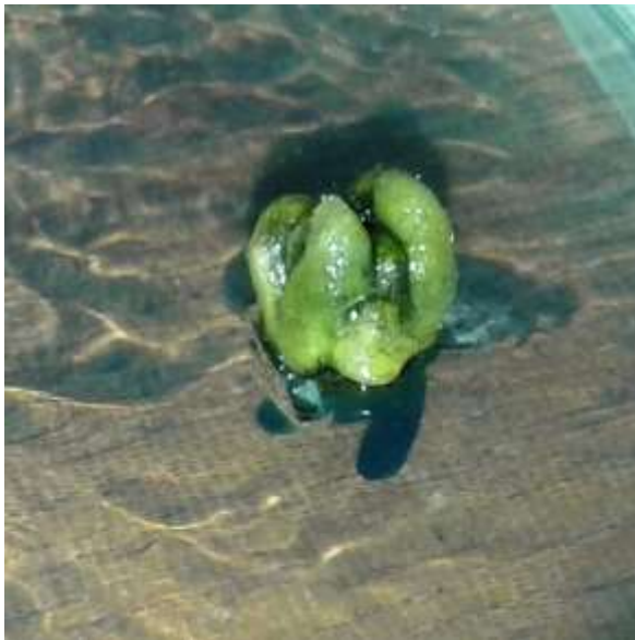
Figure 4. In vitro culture of pecan bud ('Ukulinga').

NAA. Browning of the growth medium is the result of polyphenol oxidation exuded from the cut end of the explants. Generally, it occurs at the initial stage of culture but can be overcome by adding substances such as ascorbic acid, citric acid, polyvinyl pyrrolidone (PVP) and activated charcoal to the growth medium. This