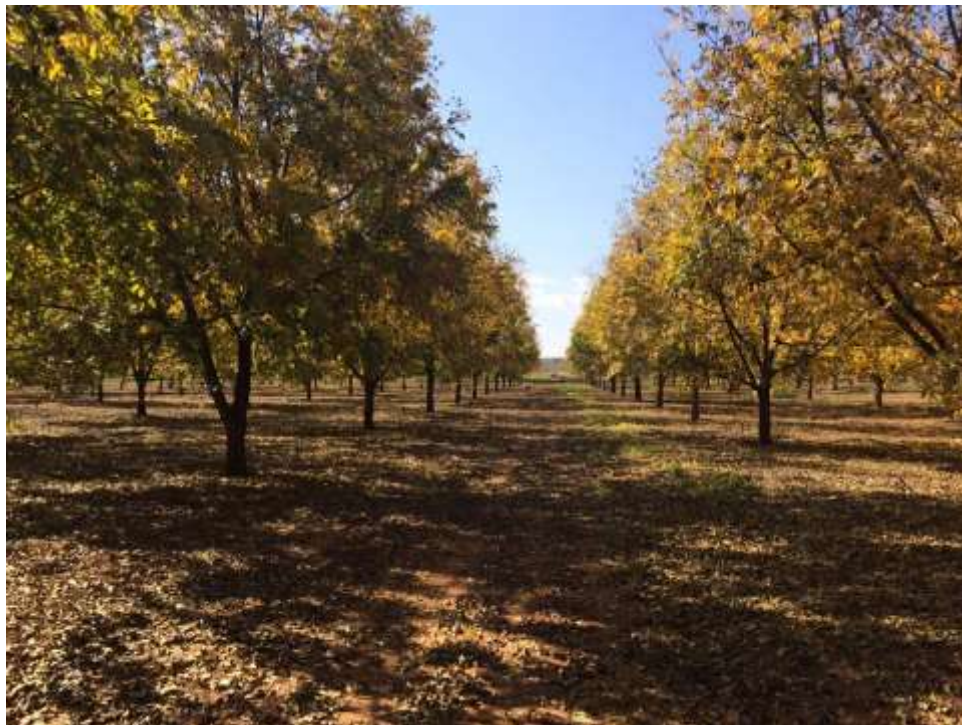
Figure 2. Pecan orchard cv. Wichita located in Hartswater, Northern Cape, South Africa.

pollination, it is crucial to choose compatible cultivars that synchronize with each other in the production of mature pollen when the stigma is receptive (Vendrame and Wetzstein, 2005). Pecan fruit is a nut, which consists of a kernel enclosed by the shell. The shape and dimension of the nut varies from cultivar to cultivar and the maturation occurs in the autumn of the same season (Peterson, 1990). The nut can be considered as a storage organ. In fact, it stores minerals, carbohydrates, oils, amino acids and proteins that will serve the future embryo for respiration, germination and even in the early life stages of the seedling until it becomes self-sufficient.