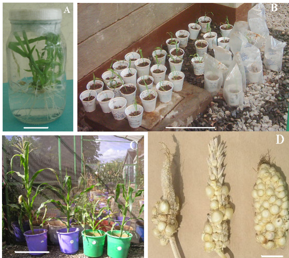
Figure 2. Regeneration of plantlets and screen house growth of Sudanese maize. (A) Plantlets Regenerating from IL3 callus cultured on regeneration II medium. Bar = 2 cm (B) Hardening of regenerated plantlets at the screen house. Bar = 25 cm. (C) Regenerated plants maturing in the Screen house. Plants growing in 20-liter pots containing loam soil. Bar = 30 cm. (D) Seeds obtained from mature regenerants. Bar = 0.5 cm.

who reported formation of compact embryogenic callus at the middle part of the scutellum and friable embryogenic callus at the basal side of the scutellum.