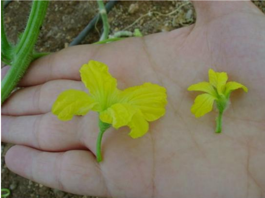
Figure 3. Male flower of dihaploid and haploid melon plant.