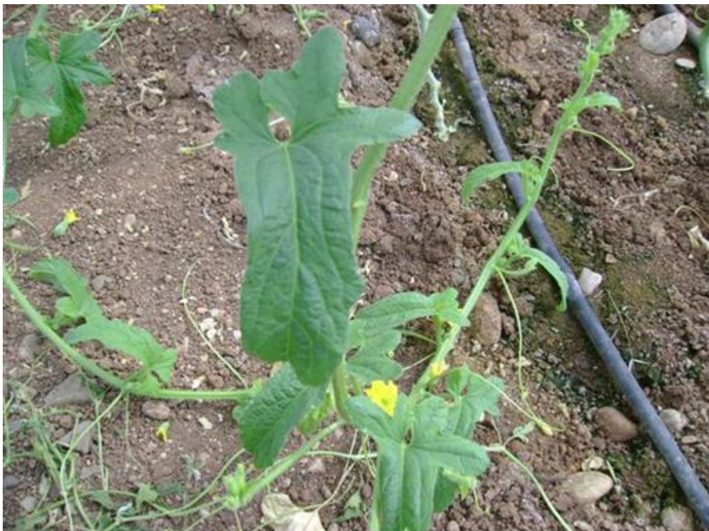
Figure 4. Abnormal leaf shape of haploid melon plant.