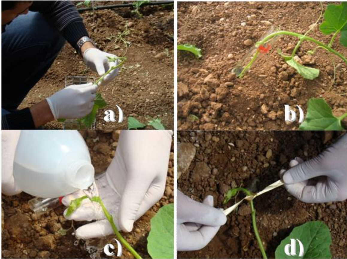
Figure 2. In vivo colchicine application steps: a) Stripping of the leaves and tendrils of apex. b) Dipping apex into colchicine solution. c) Washing apex with water. d) Labeling application point with rope.