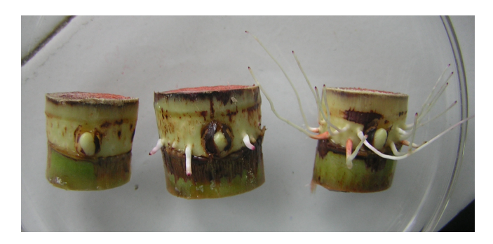
Figure 1. Different types of germinated buds of sugarcane in in vitro conditions.

Means in the same row followed by the same letters do not differ significantly (p< 0.05).