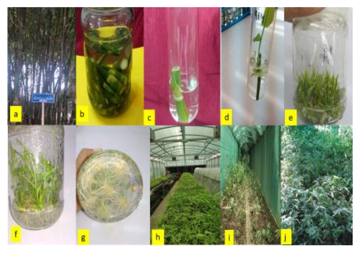
Figure 3. In vitro propagation of B. tulda using axillary node explants: (a) Source of explants, (b) Explants used for initiation, (c) One explant inoculated in MS media (MS+NAA 0.1 mg/l+BAP 1.0 mg/l), (d) Bud proliferation, (e) Multiple shoot regeneration, (f &g) Regenerated plantlets with well-developed roots, (h) Partially acclimatized plants in green house, (i) Fully acclimatized plant in shade house, and (j) One years old tissue culture raised plants in field.

was also monitored. After 30 to 45 days of primary hardening, plants were transferred to the Net or Shade house on mother bed constituting of sand and cow dung (1:1). For both species of bamboos, survival rate was