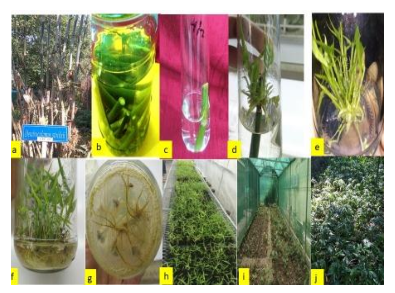
Figure 4. In vitro propagation of D. stocksii using axillary node explants: (a) Source of explants, (b) Explants used for initiation, (c) One explant inoculated in MS media (MS+NAA 0.1 mg/l+BAP 1.0 mg/l), (d) Bud proliferation, (e) Multiple shoot regeneration, (f & g) Regenerated plantlets with well-developed roots, (h) Partially acclimatized plants in green house, (i) Fully acclimatized plant in shade house, and (j) One years old tissue culture raised plants in field.

2021). With the important variables taken into account, the study reveals about the large scale mass clonal propagation of two important bamboo species ( B. tulda and D. stocksii ). These findings can be helpful for industrial adoption of in vitro propagation technology for large scale commercial production.