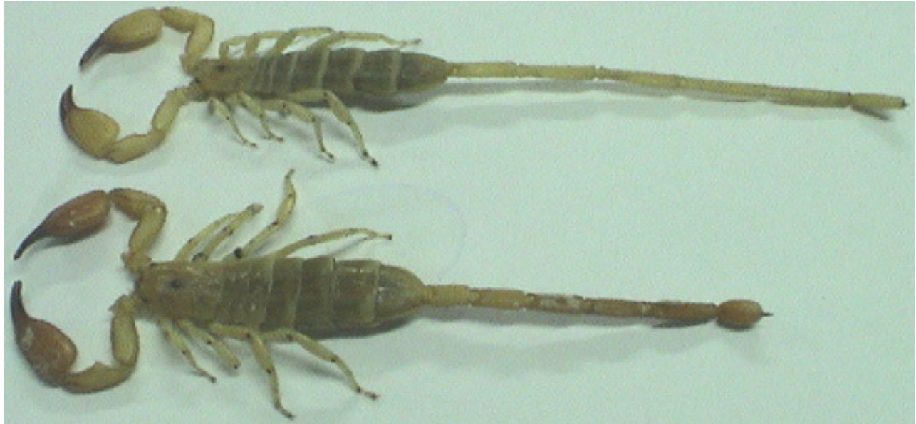
Figure 1. A photographic illustration of the male (upper figure) and female (lower figure) Hemiscorpius lepturus . Note the very short sting size and longer tail in the male.