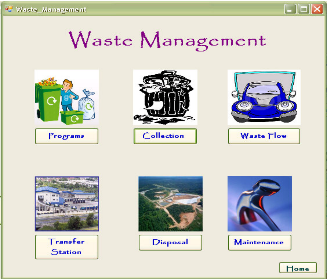
Figure 4. Waste management forms.