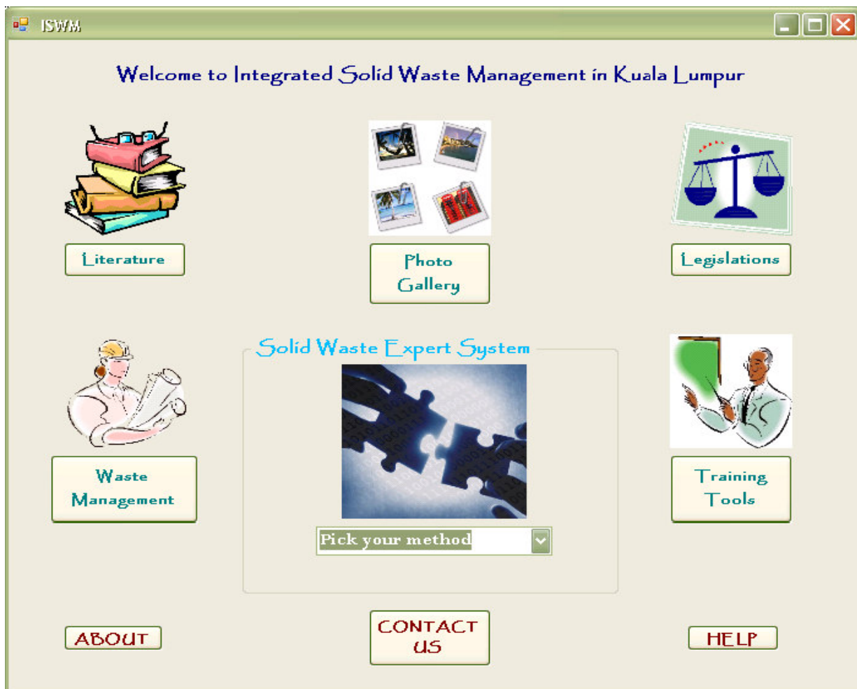
Figure 2. Main user interface.

provided for the user to get an overview content of each button so that they can easily understand the function of each button. In addition, for further information, user can find the authors' contacts at About Us button.