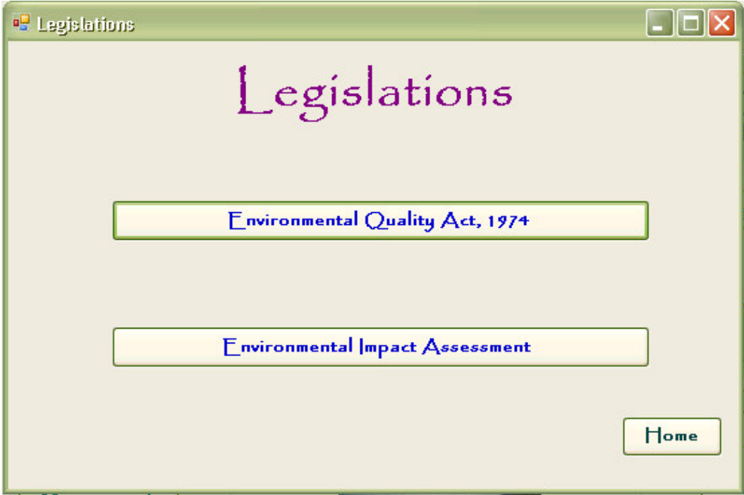
Figure 3. Legislations form.