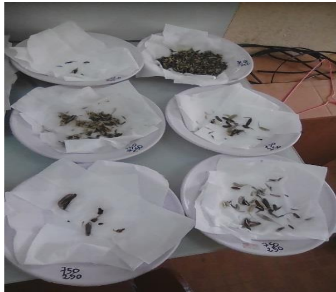
Figure 4. Larvae exposed on LOTUS® paper.

randomly selected per substrate. The measurement is done using a ruler labelled in centimeters. A total of 60 maggots were measured for all the substrates.