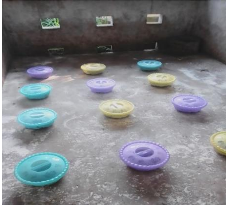
Figure 1. Experimental design 24 h after setting up.