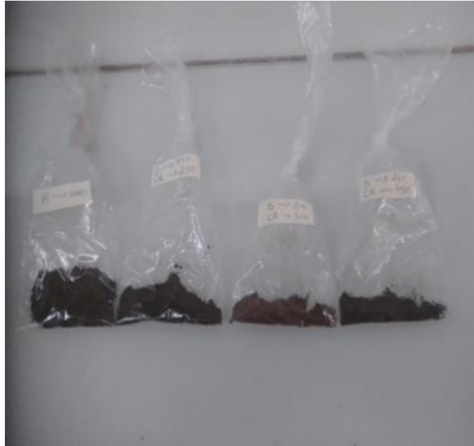
Figure 3. Maggots' flour conditioned in labelled sachets.