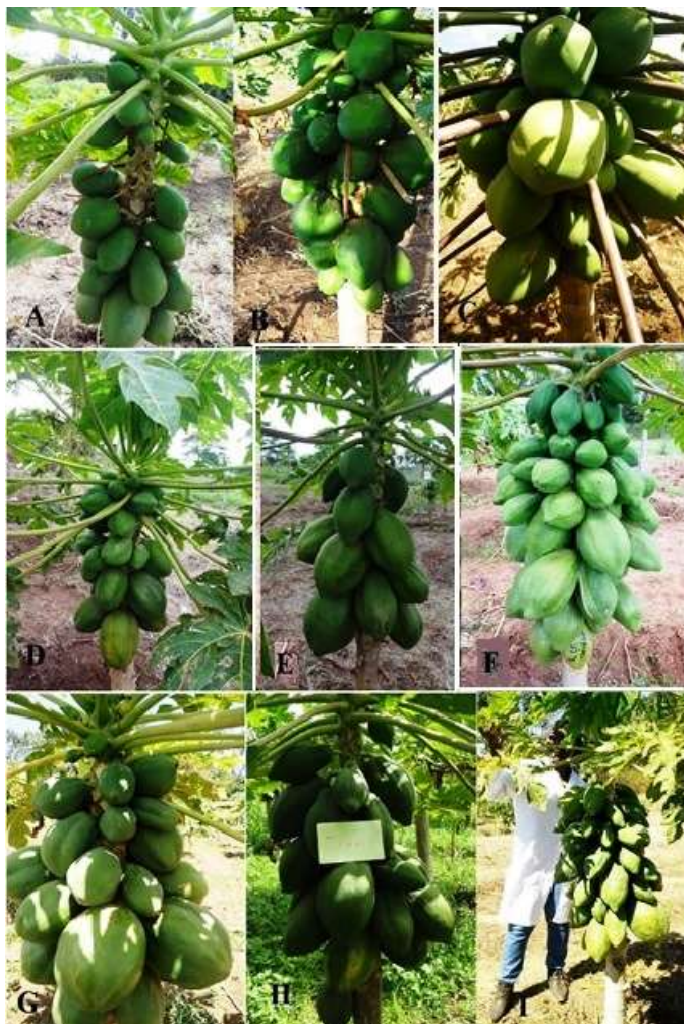
Figure 1. Morphology of new papaya hybrid lines. (A) Sunrise solo with small fruits; (B) Line 1 with small fruits; (C) Line 2 with small and medium fruits; (D) Line 3 medium to large fruits; (E) Line 4 with large fruits; (F) Line 5 with small and medium fruits; (G) Line 6 with large fruits; (H) Line 7 with small and medium fruits; (I) Line 8 with small and medium fruits.

0.05) between the new hybrid lines and the control with shortest length in control (8.5 cm) and the longest length in Line 6 (15.7 cm). The mean fruit internal cavity diameter also varied widely and significantly between the hybrids and the control from 3.1 cm in Line 7 to 11 cm in Line 6. Generally, TSS varied significantly from 7.4 to 12.3° Brix in the new papaya lines with lines 5 and 7 having the highest TSS and Line 8 with the lowest TSS (Table 1; P < 0.05 ).