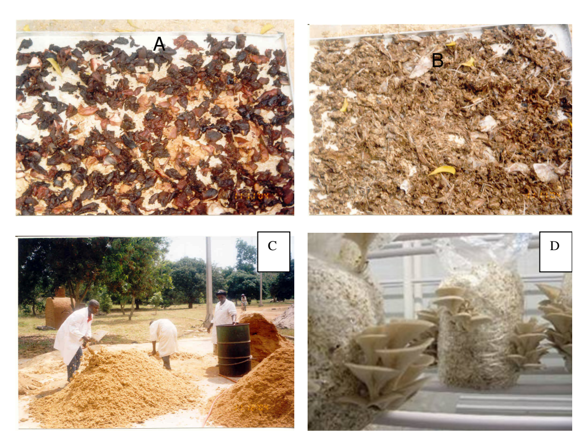
Figure 1. (A) Fresh fish waste used in this study for mushroom production. (B) Cooked fish waste used in this study for mushroom production. (C) Preparation of the seafood waste and sawdust mixture. (D) Mushroom ( Pleurotus species ) growing in compost bags.

high temperatures were recorded in this study, the death of the mushroom mycelia was not observed. This might be due to the use of delayed release supplements (fish waste, Figures 1a, 1b and 1c) providing nutrients that were released in stages and subsequently utilized for mushroom growth (Figure 1d).