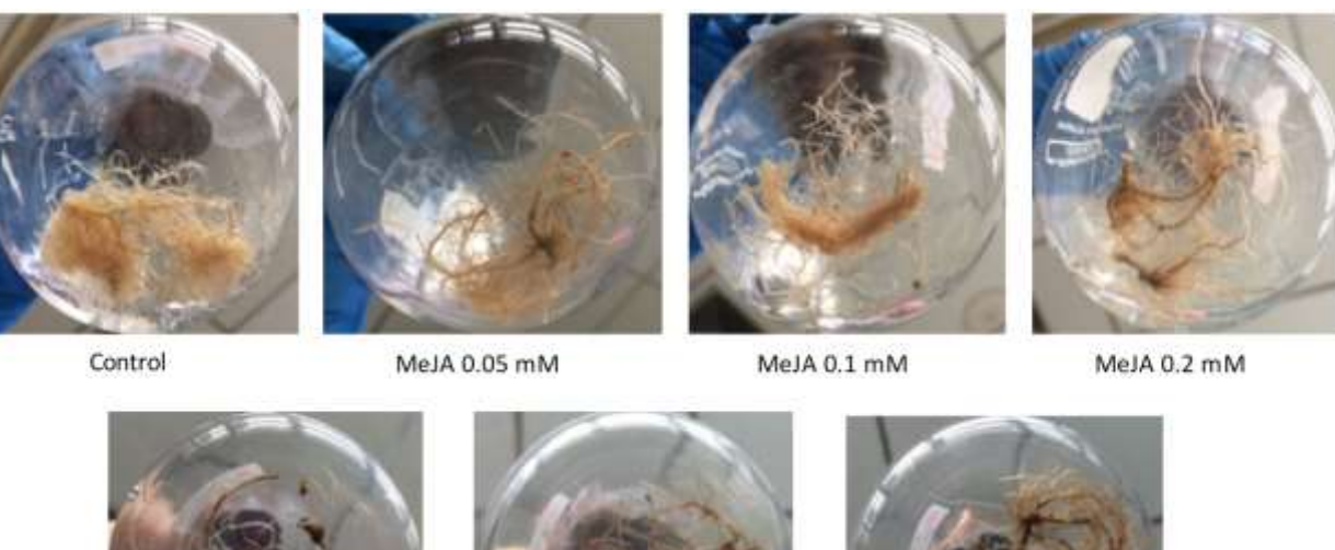
SA 0.05 mM