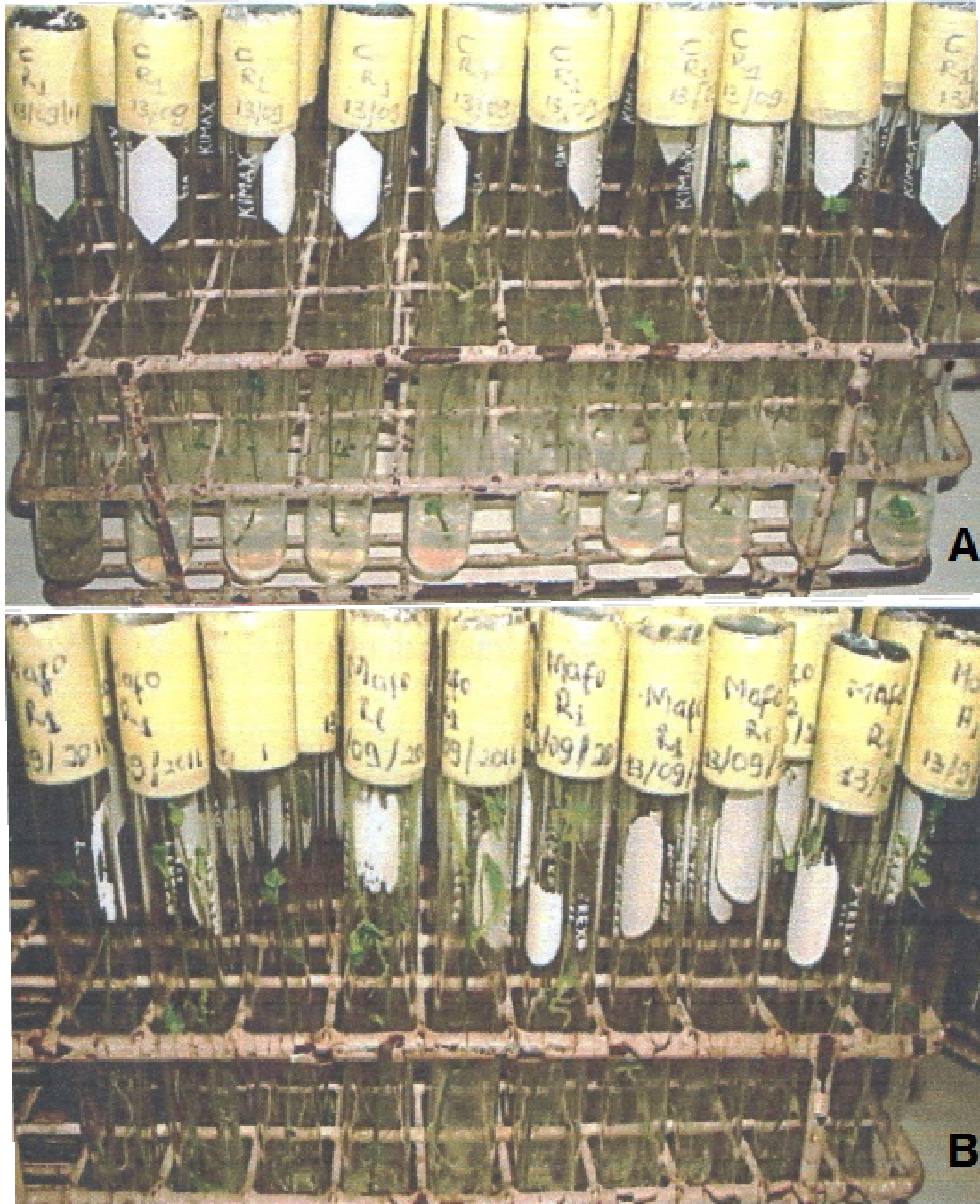
Figure 1. Mafo variety, four weeks after culture in solid (A) and liquid (B) media.

Means in a column followed by the same letter are not significantly different at p = 0.05 .