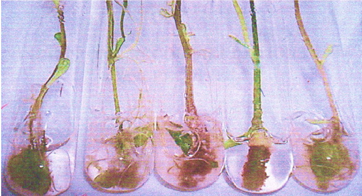
Figure 4. Callus formation on plantlets of Bambui wonder variety in liquid medium.