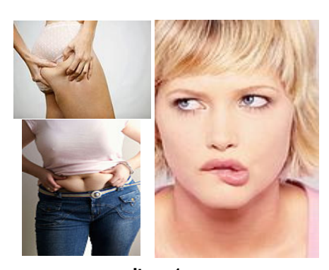
Item 1 Sexual Attractiveness