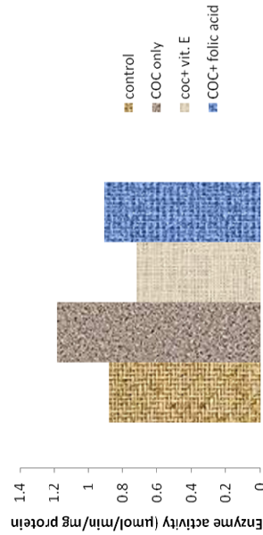
Figure 4. Effect of combined oral contraceptives, vitamin E and folic acid supplements on glutathione-S-transferase activity in female Wistar rats.

supplementation to reduce any oxidative stress that may arise from its use. Further researches on lipids profile components and enzymes activities in human subjects are in progress.