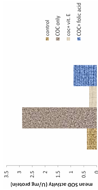
Figure 2. Effect of combined oral contraceptives, vitamin E and folic acid supplements on superoxide dismutase enzyme activity in female Wistar rats.

COC, Combined oral contraceptive; MDA, malondialdehyde. Values are means ± S.D of five animals per group. *Significantly different from control (P < 0.05).