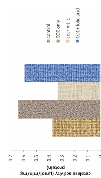
Figure 3. Effect of combined oral contraceptives, vitamin E and folic acid supplements on catalase activity in female Wistar rats.