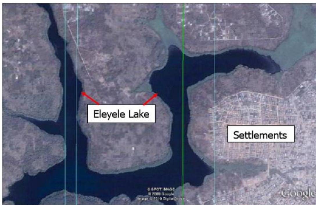
Figure 1. Map of the study area.