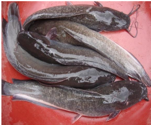
Catfish ( Clarias gariepinus )