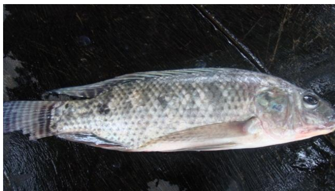
Tilapia fish ( Oreochromis niloticus )