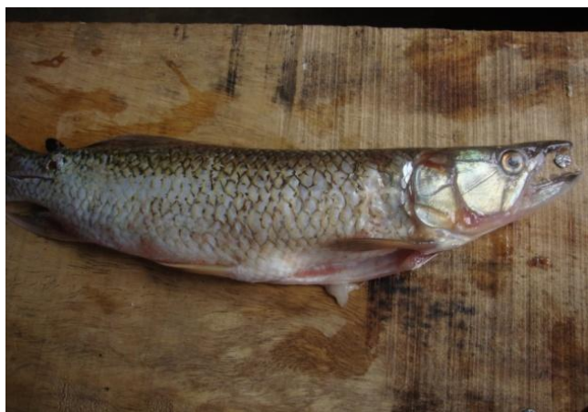
African pike ( Hepsetus odoe )