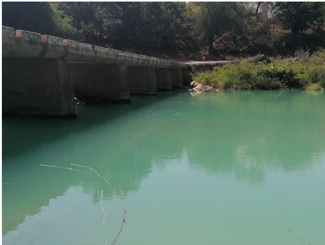
Figure 2. Discolored water in the middle reaches of Deka River, Zimbabwe.

the Runduwe Stream, which carries ZPC effluent and subsequent neutralization due to the nature of such waters that has a high pH.