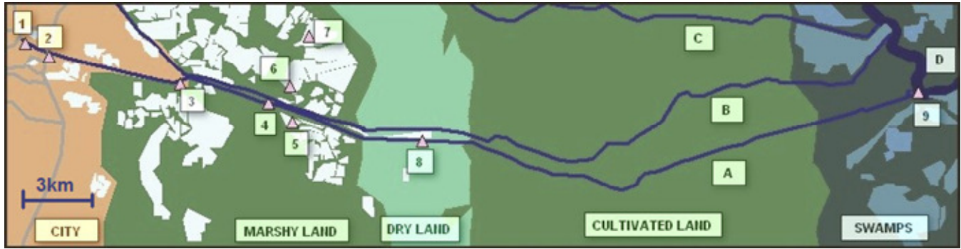
Figure 2. Sampling sites in dry weather flow (DWF) channel and the fish ponds in EKW. Sample locations: 1) Topsia, 2) Ambedkar Bridge, 3) Bantala, 4) Bamunghata, 5) Nalban, 6) Chachchria, 7) Dhalibheri, 8) Karaidanga and 9) Ghusighata. Canals and rivers: A) storm water flow (SWF), B) dry weather flow (DWF), C) Bagjola Khal (canal) and D) Kulti River.

stakeholders of the EKW (Fish Producers Association (FPA), Save Wetlands Committee (SWC), Labour Unions, etc.), supporting the sustainable livelihoods of the community without hampering ecologically balanced wetlands. The present study analyzed the impact of excess flow on the water volume of the sewage ponds based on the depth and the catchment area of the ponds, by using two neural network models. The additional sewage flow to these ponds will enhance the continued wise use of this facility. The additional sewage load in conjunction with some remedial measures to the existing channel system will potentially enhance fish production by providing additional flow (that is additional fertilizer) for the pond system. The additional sewage flow is predicted to meet WHO guidelines for wastewater-fed aquaculture and irrigation for agriculture. Discharge standards into inland waters will still be met.