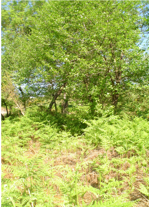
Figure 2. The Aulnaie of Ain Khiair.

microclimate. Commonly, according to the classification of Emberger (1955), the zone is located in the sub humid bioclimatic floor characterized by a cold and wet winter and a warm and dry summer. The volume of rain varies from 717.2 to 944 mm per year; January being the rainiest month. This considerable volume is due to the absence of topographic obstacles as well as to the nearness of the sea and the surrounding lakes of the wet complex of the region of El Kala. The thermal variations show that August month is the warmest month, the minimal of the average temperatures are of 8°C and the maxima of 29.7°C.