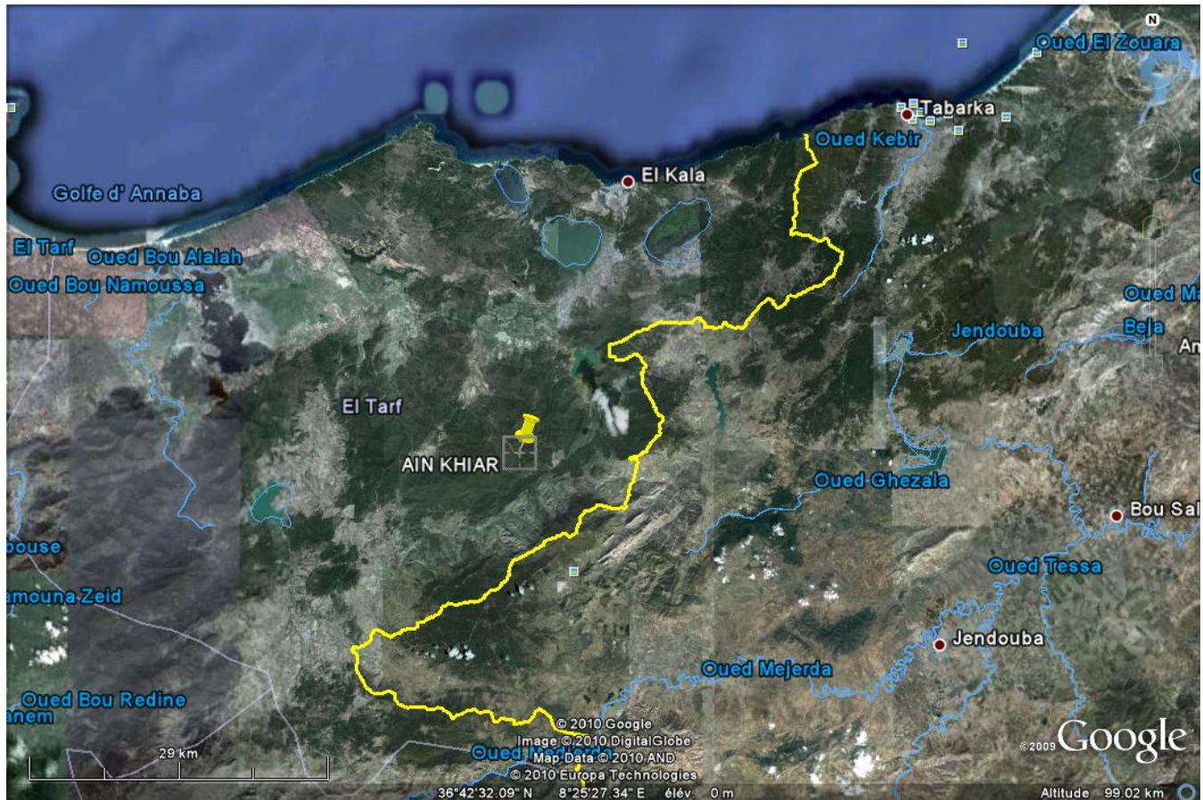
Figure 1. Location of the Aulnaie of Ain Khiair with regard to the PNEK (Source: Google Earth, 2010).

(synecology) and the fungal communities as descriptors of these conditions (mycocoenological study).