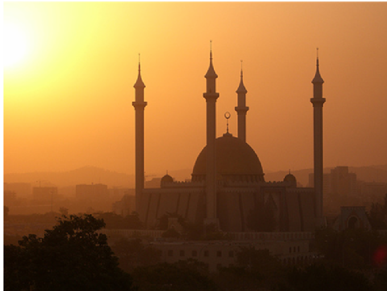
Figure 1. The mosque in Abuja Nigeria, seen through the harmattan haze.

It is the season to cover up. Beginning in November of every year and ending around March, fine particulate matter (typically 0.5 – 10 micrometers) emanating from the Sahara desert blow south, obscuring vision and laboring breathing for everyone (Figure 1). In addition, the dry dusty winds cause a variety of domestic inconveniences because of the layers of dust that envelope everything both outdoors and indoors. This is harmattan season, and it is ingrained in all West