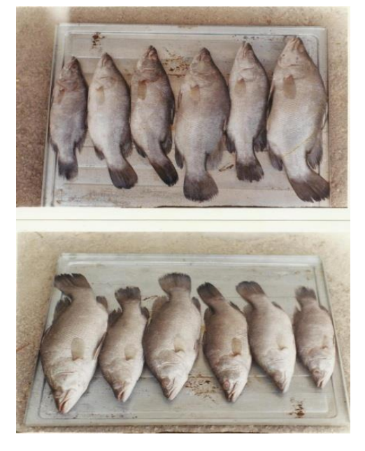
Plate 1. The fresh fish samples.