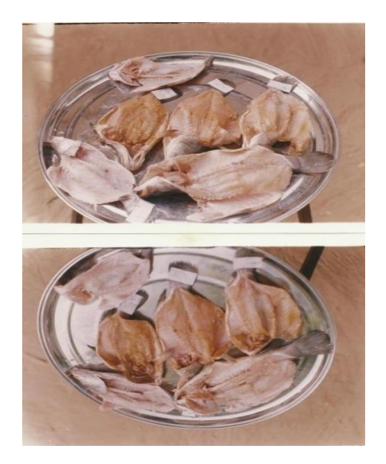
Plate 2. The prepared samples.

plastic container ( 80 \times 20 \times 45 cm) with tight lid, and packed with crushed ice to minimize deterioration of the fish during transportation to the laboratory in Maiduguri. For the purpose of comparison, samples were equally divided and a portion of it was taken to a local processor in Gamboru ward, for "Bunyi your" to be produced using the normal traditional method, this product served as the commercial control sample. Cloves ( Eugenia carryophyllata ) were obtained from Maiduguri Monday Market while glucose of analytical grade (BDH Chemicals Ltd, U.K.) was obtained from chemicals supplier in Maiduguri.