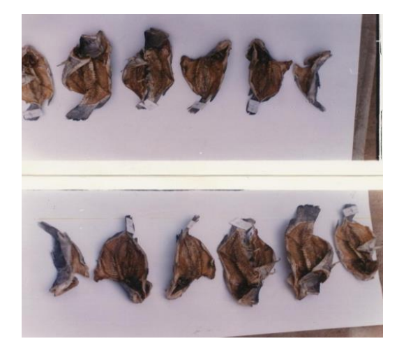
Plate 4. Solar tent-dried samples.