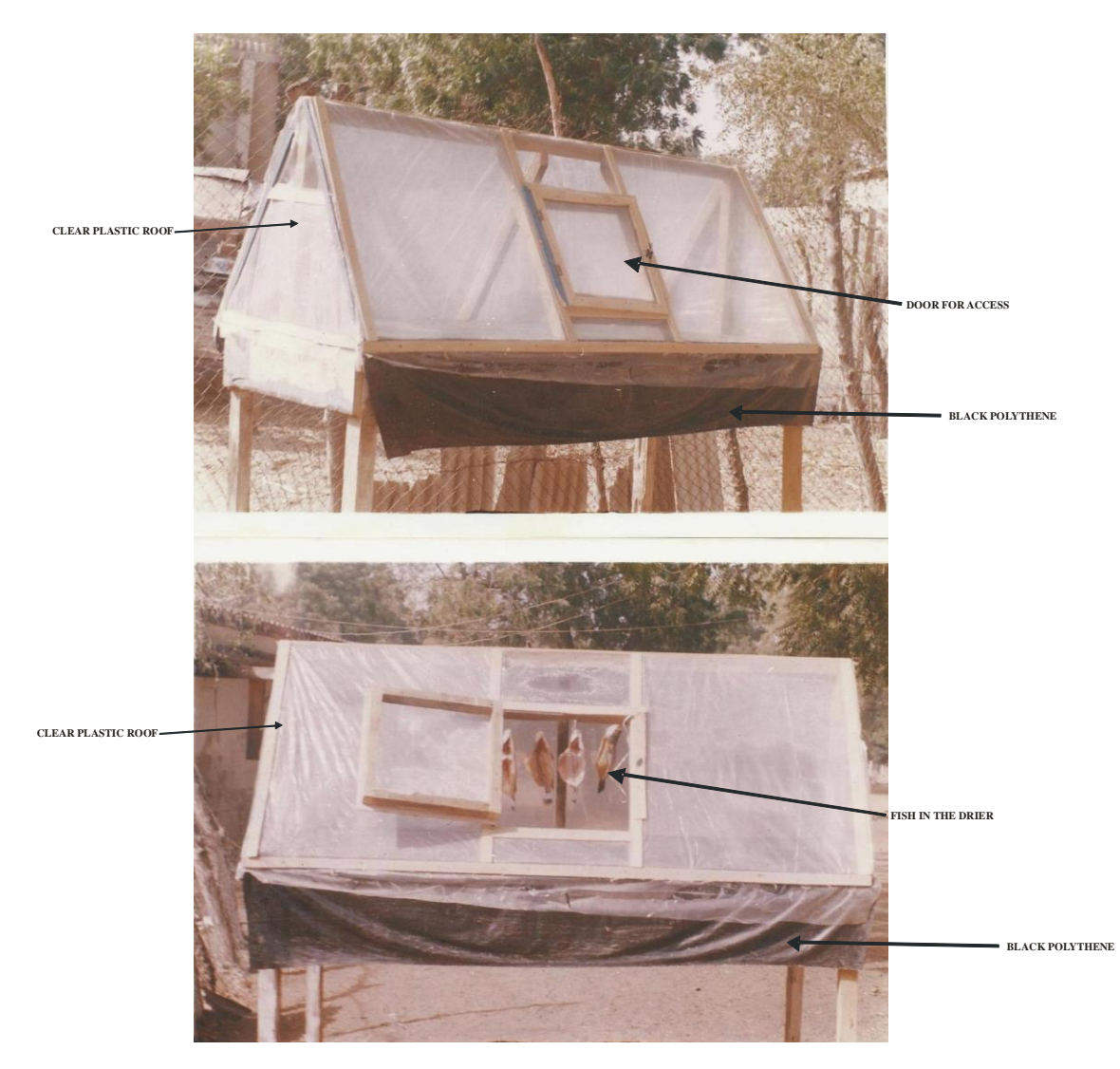
Plate 3. The solar tent-drier during drying.

heart infusion agar (Oxoid) Sabourand agar (Topley House, England), Lauryl sulphate tryptose broth, Brilliant green lactose broth and Eosin methylene blue agar (Biotec) were obtained and used for the isolation, enumeration and identification of the microorganisms associated with "Bunyi youri" processing. All glass wares including petri-dishes, test tubes, pipettes, flasks and bottles, were sterilized in a hot air oven at 170 \pm 5^{\circ} C for at least two hours, while the media and distilled water were sterilized by autoclaving at 121°C for 15 min and at 15 psi (Marshall, 1992; Quinn et al., 2002), and each medium was prepared and used according to the manufacturer's instructions. The media were allowed to cool to about 40°C before pouring or plating.