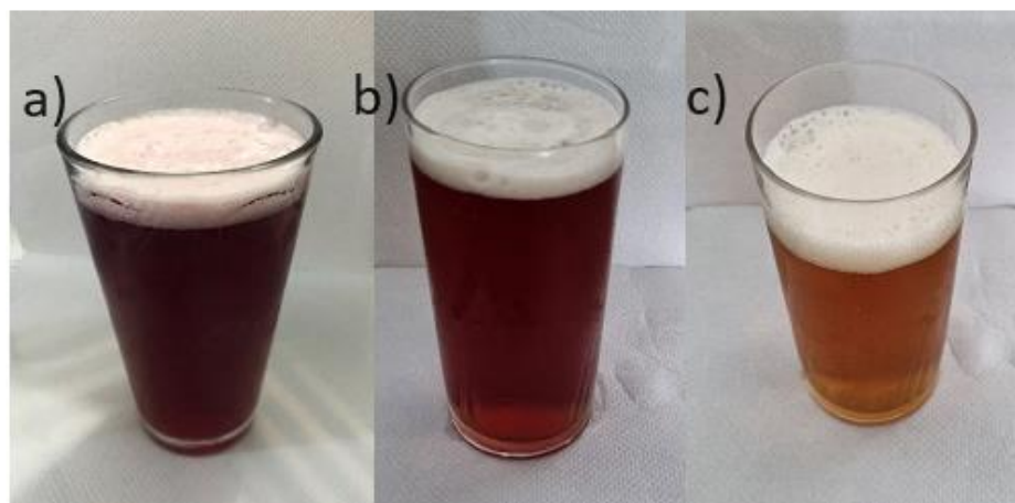
Figure 2. Aspect of the beers: a) Purple sweet potato beer; b) Purple and yellow sweet potato beer; c) Yellow sweet potato beer.