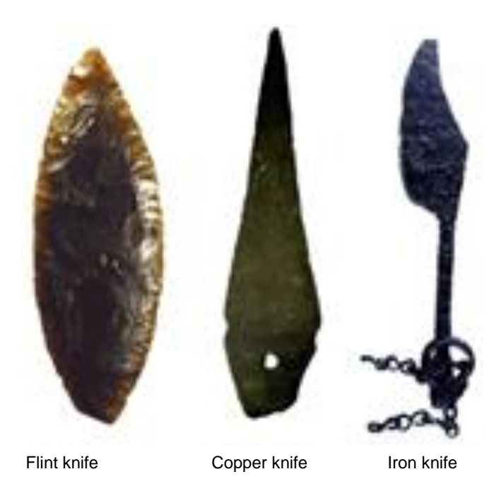
Figure 1. The oldest known knives are made of flint, copper and iron. These knives were also used as weapons and were designed with a gun appearance.