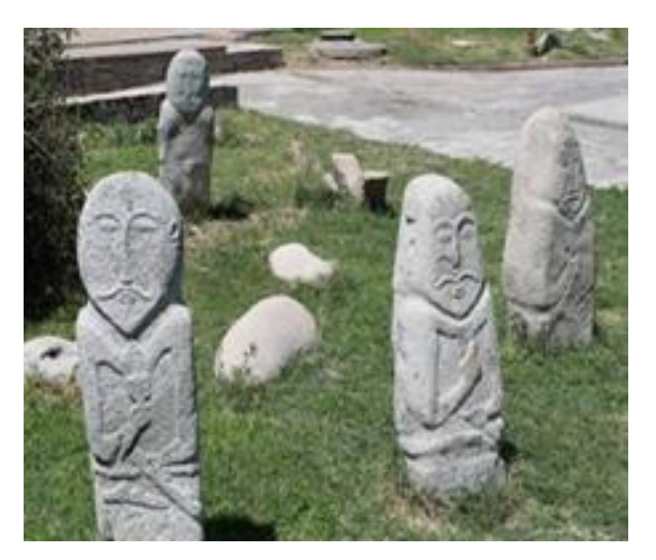
Figure 5. Göktürk statues which have the goblet in the hands and the sword at around waist.