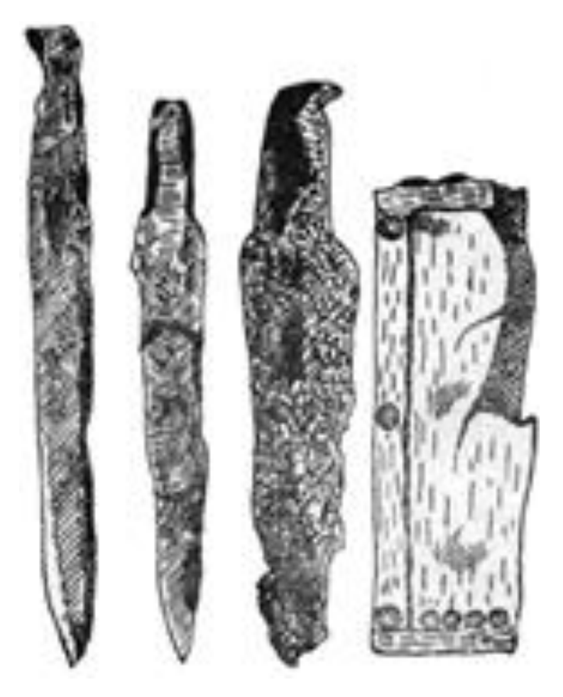
Figure 2. Examples of iron swords and knives of the hound. Lower Volga region.