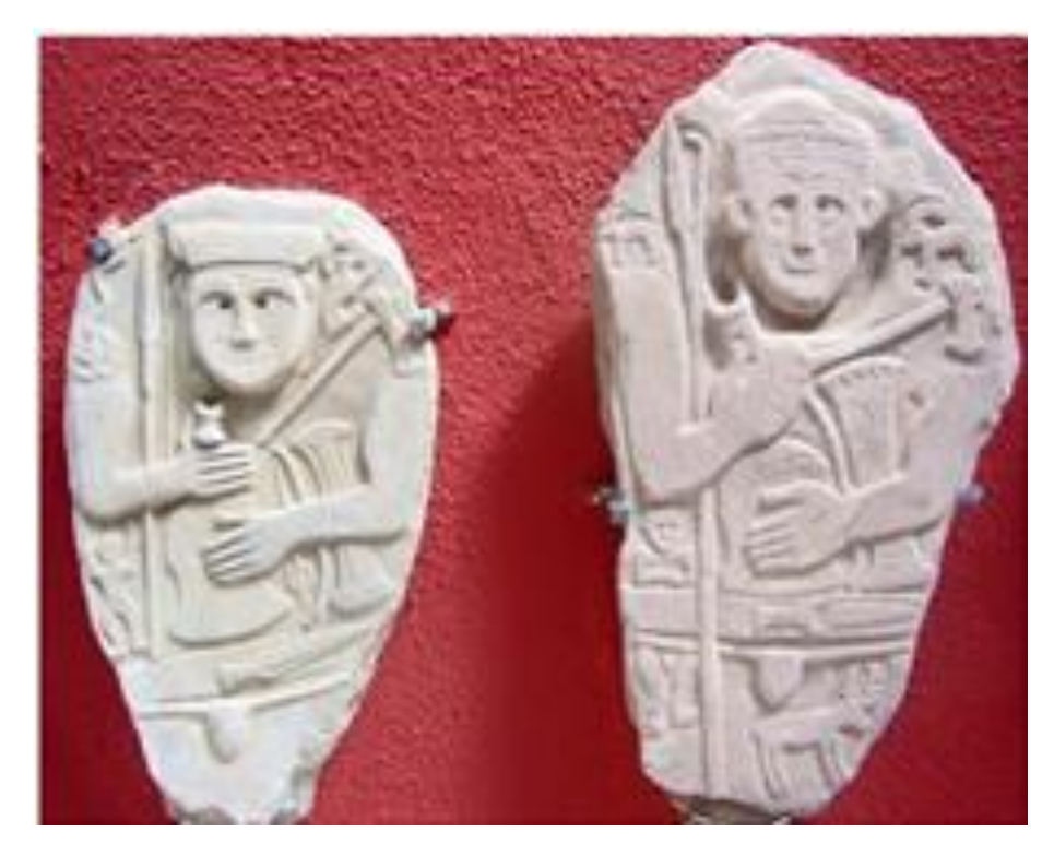
Figure 4. The image of one of the human-shaped Hakkari tombstones containing depictions of ancient Turkish life and beliefs (mountain goat, deer, bengi water turt, etc.) (Van Müzesi, Cengiz Alyılmaz). The dagger embossing on their waists is remarkable. Source: Photograph: Veli Sevin.