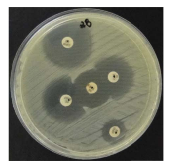
Figure 2. Induction of resistance by the presence of imipenem disc by "D Zone" formed. This isolate is shown to produce AmpC enzyme in the presence of inducer antimicrobial and it is classified as chromosomal gene carrier.

The most enterobacteria isolated were Proteus mirabilis (45.3%) and E. coli (40.5%), the other enterobacteria isolated were Citrobacter freundii (4.8%), Serratia marcescens (4.8%), Serratia rubidae (2.4%) and