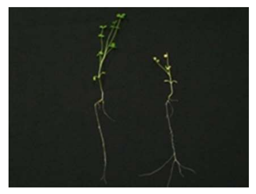
Figure 2. Serradella inoculated with effective rhizobia, 35 days after emergence (left) and serradella not inoculated, 35 days after emergence (right).