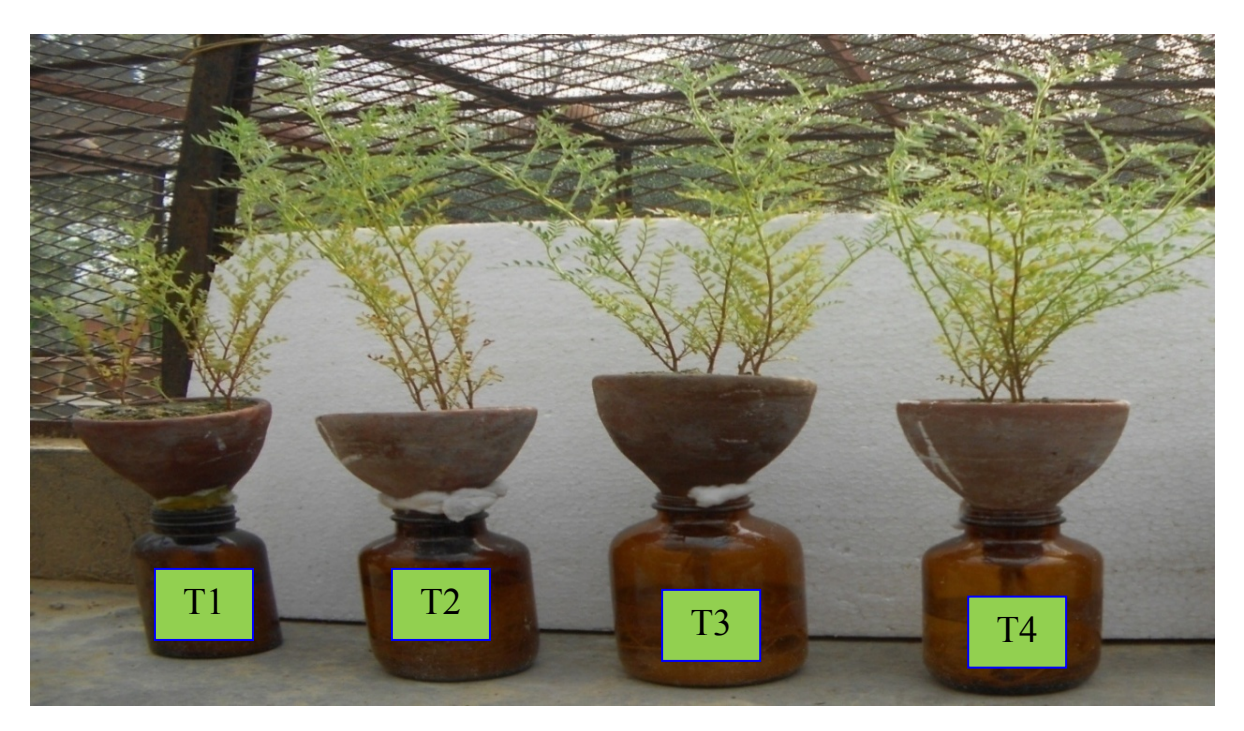
Figure 3. Inoculation effect of Mesorhizobium isolates on nodulation and plant growth of chickpea after 80 days under chillum jar conditions. T1: Uninoculated control; T2: Mesorhizobium KR48, ACC<sup>+</sup>; T3: Mesorhizobium MHD2, ACC<sup>+</sup>; T4: Mesorhizobium MBD26, ACC<sup>+</sup>.

Values in the second line of each treatment represent the values observed when plants were grown under salt conditions.