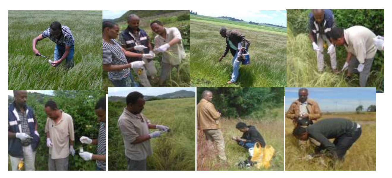
Figure 2. Activites during teff rhizosher soil collection.

probability for species identification (Biolog1993).