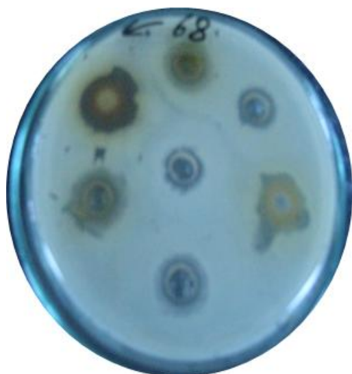
Figure 2. Zone of inhibition of different probiotics showing fungicidal activity of L. acidophilus (mare colostrums, goat colostrums, buffalo –cow milk), L. palantarum (cow milk), L. rhamnosus (cow milk), Bifidobacterium (cow milk) and B. suibtlus (mare fecal sample) in sequence with the arrow show in C. albicans .