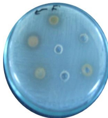
Figure 3. Zone of inhibition of different probiotics showing fungicidal activity of L. acidophilus (mare colostrums, goat colostrums, buffalo –cow milk), L. palantarum (cow milk), L. rhamnosus (cow milk), Bifidobacterium (cow milk) and B. suibtlus (mare fecal sample) in sequence with the arrow show in A. fumigatus .

Falagas et al. (2006) proved the efficacy of using L. acidophilus , L. rhamnosus GR-1 and L. fermentum RC-14 in reducing the vaginal candidiasis colonization.