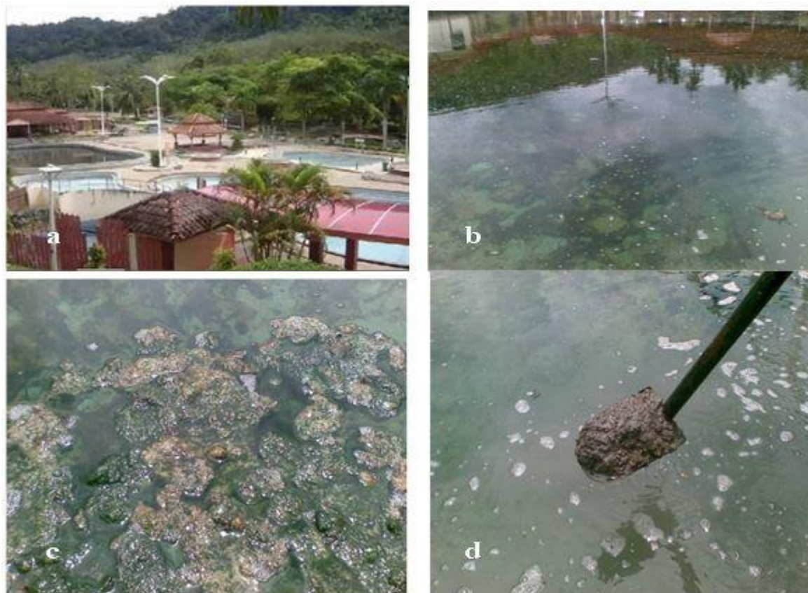
Figure 1. Location of Ulu Legong Hot spring and various sites of for sample collection (a) Ulu Legong hot spring, (b) water, (c) biomat and (d) sediment.

collected from the water surface, biomats and sediments, respectively. These three thermo flasks were sent to the laboratory within a period of three hours before inoculation was done. One milliliter of sample from each flask was transferred to each of the bottles, consisting of 10 ml media in a 30 ml sterilizes universal bottles and was conducted in triplicates. The temperature was 60°C and pH was 7.81.