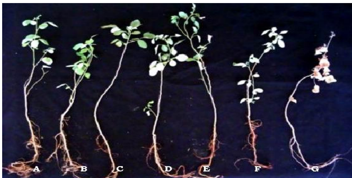
Figure 4. Effect of different neem products (root injected) on growth of shisham seedlings inoculated with F. solani ; A neem oil; B neem seed decoction; C neem seed without coat; D neem seed coat; E neem leaf extract; F control (inoculated); G control (un-inoculated).

(20.333 and 26.000 cm) and neem leaf extract (18.333 and 25.667 cm) as compared to untreated and inoculated seedlings 12.000 and 22.000 cm), respectively (Table 3). There was significant increase in root and shoot weight when neem oil applied at root zone of the seedlings (2.100 and 2.510 g), (Figure 4) followed by neem seed decoction (1.900 and 2.300 g), neem seed without coat (1.800 and 1.833 g), neem seed coat (1.700 and 1.733 g)