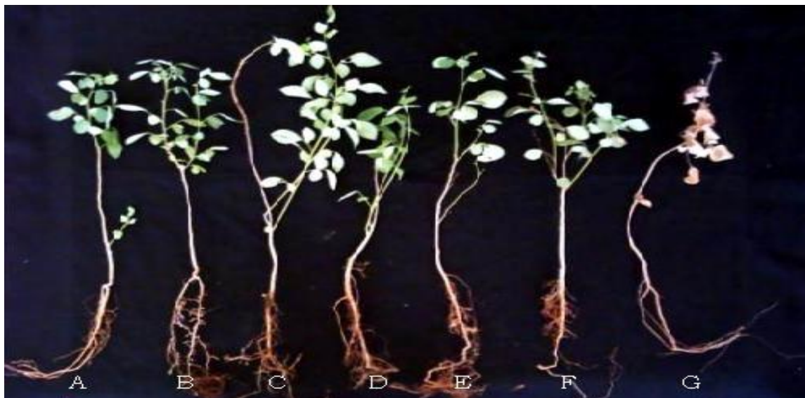
Figure 2. Effect of different neem products (spray) on growth of shisham seedlings inoculated with F. solani ; A neem oil; B neem seed decoction; C neem seed without coat; D neem seed coat; E neem leaf extract; F control (inoculated); G control (un-inoculated).