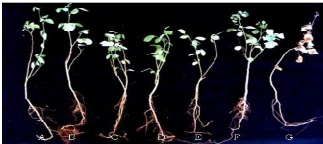
Figure 3. Effect of different neem products (soil drench) on growth of shisham seedlings inoculated with F. solani ; A neem oil; B neem seed decoction; C neem seed without coat; D neem seed coat; E neem leaf extract; F control (inoculated); G control (un-inoculated).

Maximum increase in root and shoot weight was also obtained with neem oil (2.100 and 2.800 g), neem seed decoction (1.866 and 2.300 g) and neem seed without coat (1.700 and 1.800 g). Neem leaf extract also increased the root and shoot weight (Figure 3) as compared to untreated and inoculated shisham seedlings (0.322 and 0.766 g), respectively (Table 2).