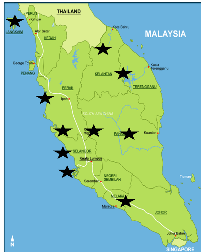
Figure 1. Outline map of Peninsular Malaysia showing the locations of samplings performed in the present work.

According to our observations and discussion with Citrus growers in Malaysia, the Citrus trees are propagated by air layering method in this country. There were some reports on occurrences of CTV in Peninsular Malaysia that needs attention, as information on CTV in Malaysia is limited; hence, this research was carried out to determine the distribution and host range of CTV in