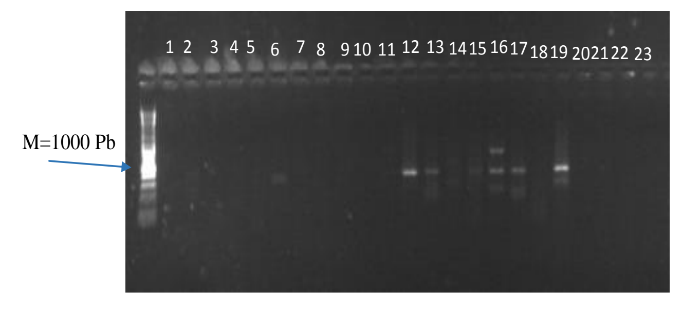
Figure 2. PCR agarose gel from PER and GES. Legend: 1 to 13 correspond to the PER gene; 14 = negative control; 15 to 23 correspond to the gene GES, M = Molecular Weight Marker (GeneRuler 1Kb DNA Ladder).