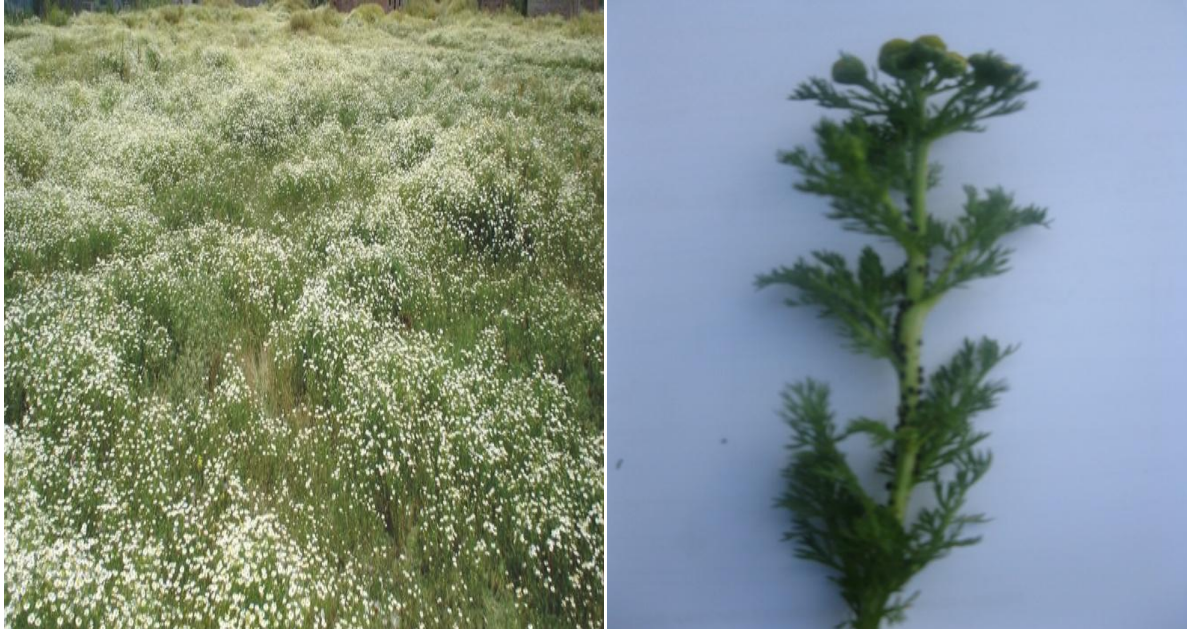
Figure 1. A view of invasion by Anthemis cotula in the Kashmir Himalaya (left) and its association of black aphids within Europe, the native range of the species (right).